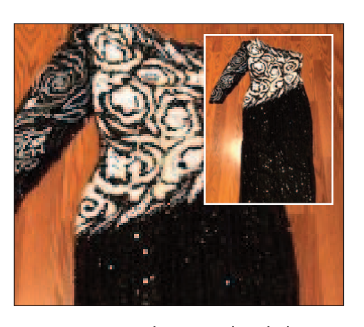
Item #7 Vintage luxurious beaded gown donated to NJTap from Mercedes Ellington for NJTap performance "Tappn' At the Ballet" Starting Bid: $150.00