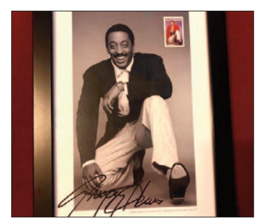
Item #1 Framed photo of U.S.Postal Service Forever Collection honoring the late great Gregory Hines Starting Bid: $75.00