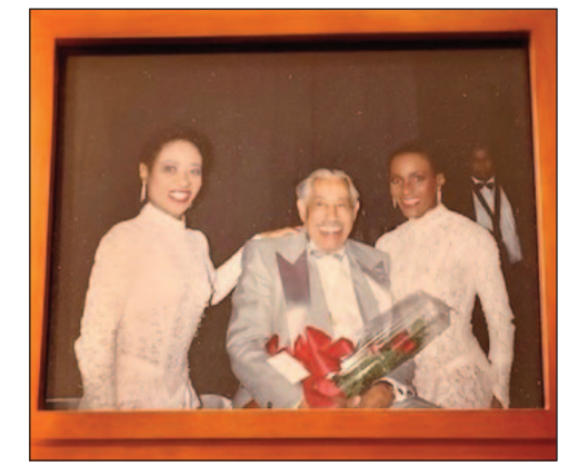
Item #6 Framed photo of Cab Calloway and The Rhythm Queens Starting Bid: $75.00